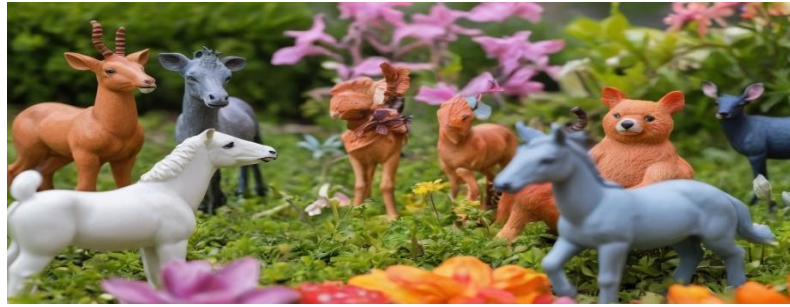
An AI-generated image of the floral garden

Note: Image generated using Wepik from the prompt the floral garden.